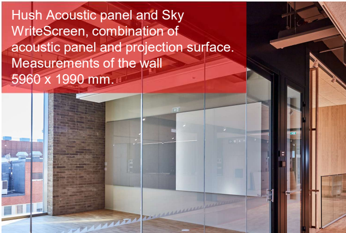
Hush Acoustic panel and Sky WriteScreen, combination of acoustic panel and projection surface. Measurements of the wall 5960 x 1990 mm.